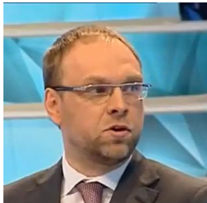
Sergiy VLASENKO Ukraine, EPP/CD

Again, this makes a mockery of the judicial process, I've got to say, in Russia. The allegation that the Russian courts are simply operating as a political arm of the Kremlin becomes a very real one."