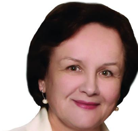
Laima Liucija ANDRIKIENĖ Lithuania, EPP/CD

“Along with several Members of the German Bundestag – from four parliamentary groups, in both government and opposition – we recently expressed our complete solidarity in a letter to Alexei Navalny. We consider his treatment to be irreconcilable with the European Convention for the Prevention of Torture and Inhuman or Degrading Treatment or Punishment. For this reason, we also demand, today, rapid and unrestricted access for the CPT to assess the detention conditions. With this resolution, we therefore call upon the Committee of Ministers to use all means at its disposal to also ensure application of the court’s ruling to the Navalny case.”