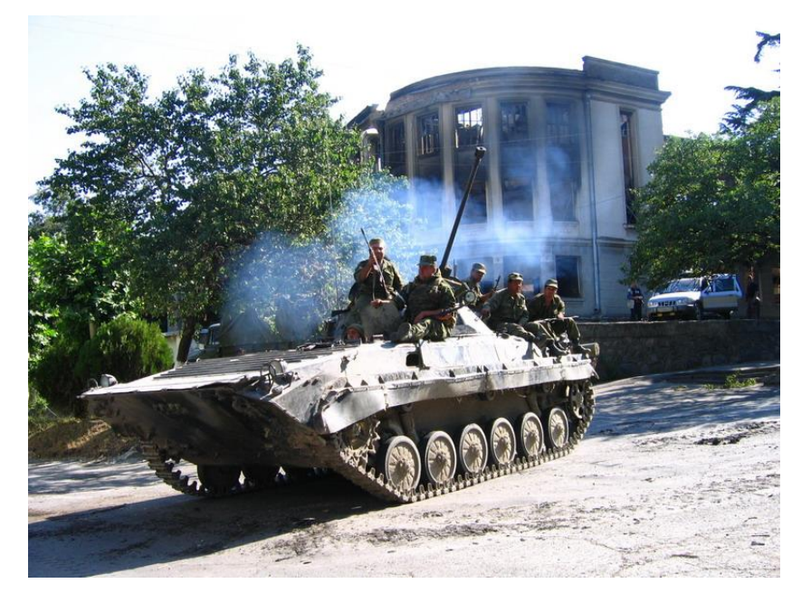
Russian attack on Georgia in 2008

<u>Negotiating with a pointed gun – Sanctions, appeasement and the role of Russia in the</u> <u>Council of Europe</u> (8 October 2018)