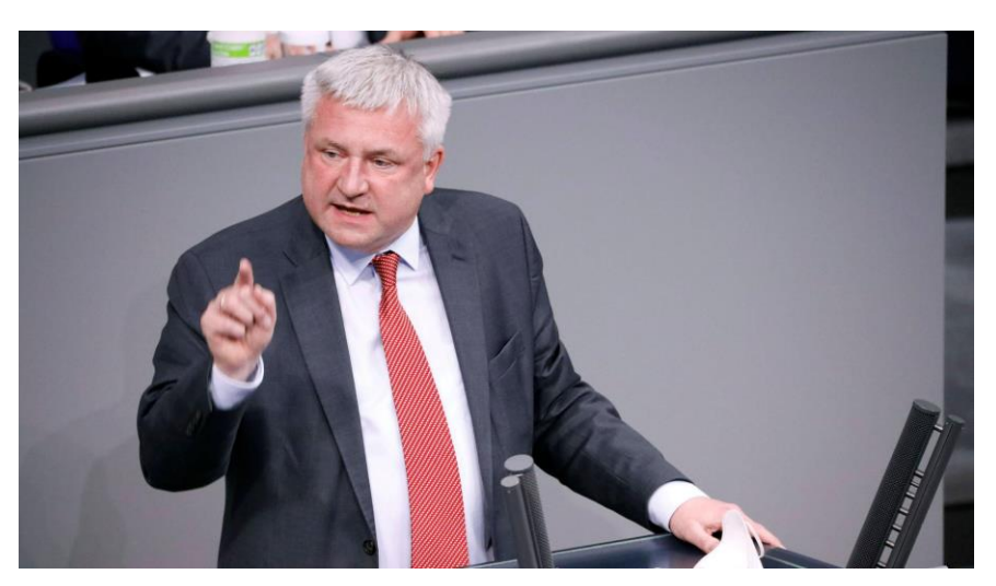
Knut Abraham, MP in the Bundestag