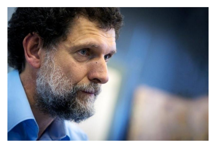
Osman Kavala, in jail in Türkiye since 2017

On 11 July 2022, the European Court of Human Rights stated in a ruling on Osman Kavala: