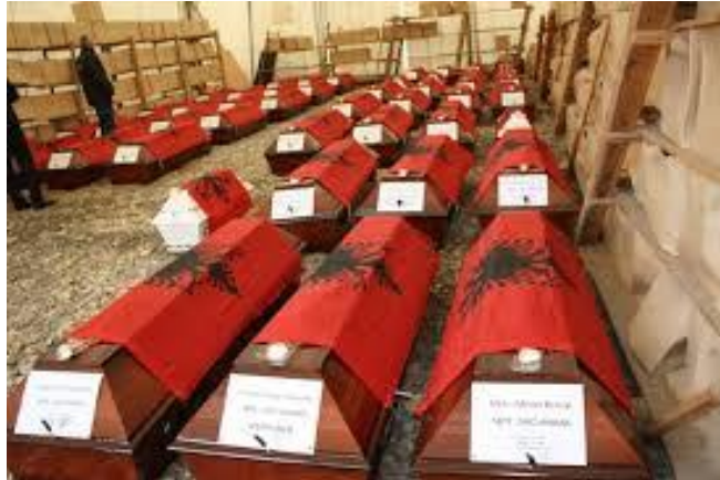
1999 victims in Kosovo

The goal in Sarajevo was to make “war unthinkable” by changing the nature of borders and societies through integration and cooperation. Borders were to become both inviolable and invisible.