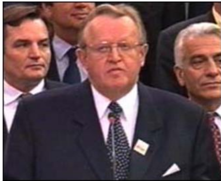
European Union President Martti Ahtisaari, who also is Finland's president, chaired the summit

The goal in Sarajevo was to make “war unthinkable” by changing the nature of borders and societies through integration and cooperation. Borders were to become both inviolable and invisible.