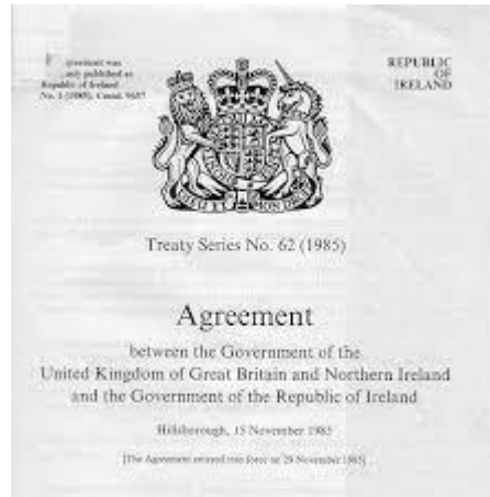
The Anglo-Irish Agreement of 1985 – six decades after independence

The 1937 Irish Constitution distinguished between the “national territory” and the “extent of application” of Irish laws. It asserted the right of the Irish parliament and government to “exercise jurisdiction over the whole territory” at their discretion. This was a territorial claim for control of Northern Ireland, which remained in place for over 60 years.