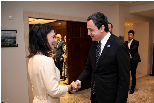
Berlin, April 2024