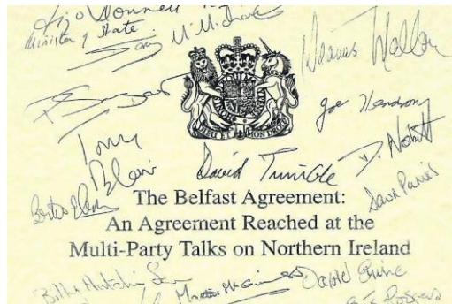
The Belfast Agreement of 1998 – another decade later

However, when Ireland and the UK joined the Council of Europe and, in 1973, the European Economic Community, both countries became members of the same international organisations. Over time, as they confronted each other as equal partners in these institutions, relations between Dublin and London improved. Societies left behind bitter memories, including those of the Irish war of independence. The process of EU integration and finally the Good Friday Agreement in Northern Ireland in 1998 helped to make the border between Ireland and Northern Ireland invisible. In 1999 the territorial claim in the Irish constitution was revoked following a referendum.