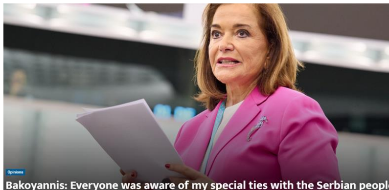
Article by Dora Bakoyannis, 1 May 2024

No candidate member has ever been asked to undertake so many reforms before even being brought up for discussion on its accession to the Organization. This is probably why 83% of the Assembly voted in favor of the Report. ”