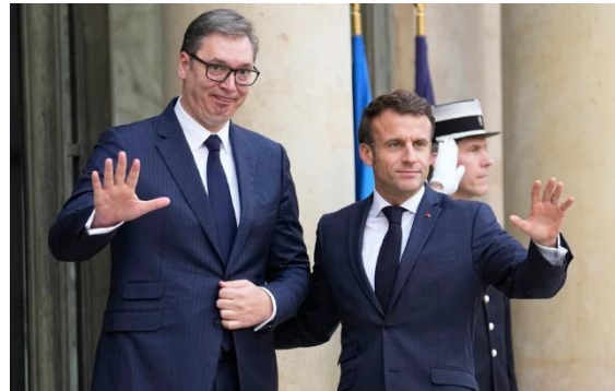
Paris, April 2024