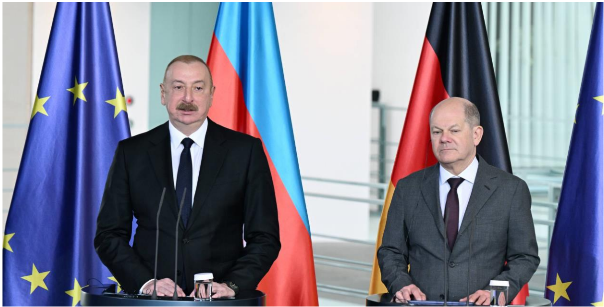
Ilham Aliyev and Olaf Scholz in Berlin, 26 April 2024