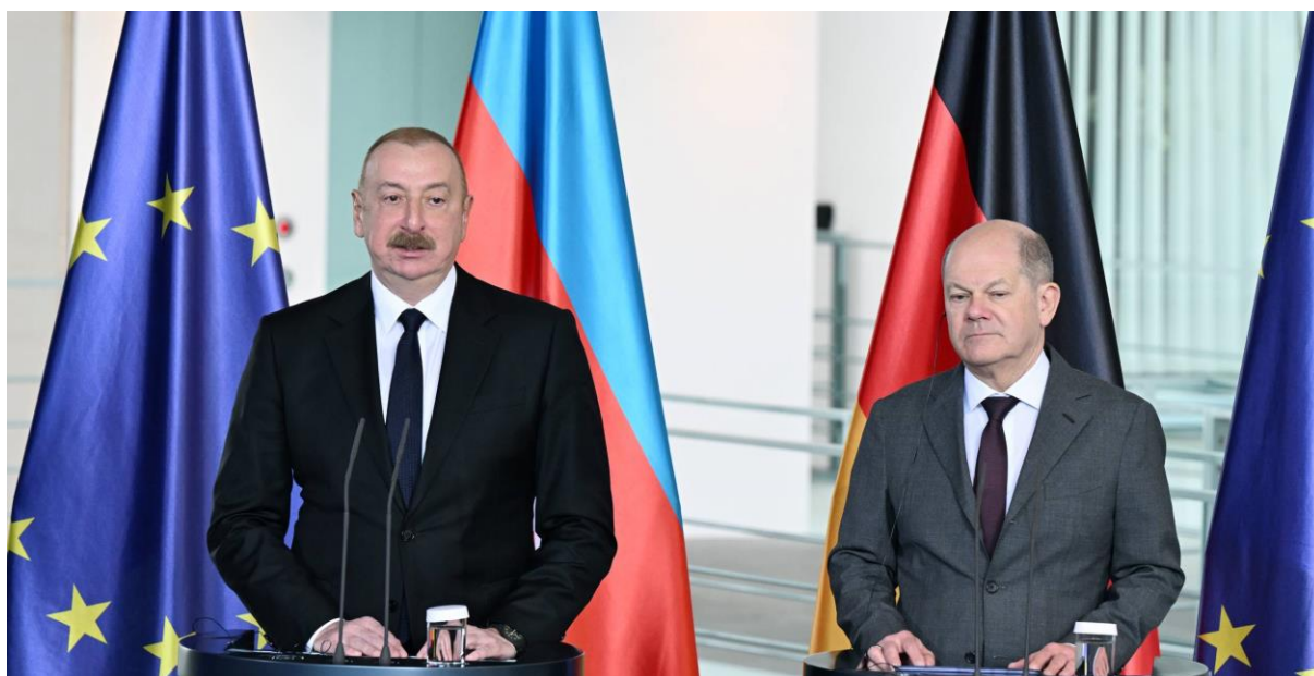
Ilham Aliyev and Olaf Scholz in Berlin, 26 April 2024