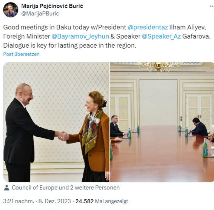
Marija after her meeting with President Aliyev

The Secretary General largely ignores the fate of political prisoners. She ignores the darkness that has descended upon the few remaining independent journalists. She ignores the abysmal record of Azerbaijan when it comes to implementing ECtHR judgements. And she ignores the most basic question: is Azerbaijan still a democracy?