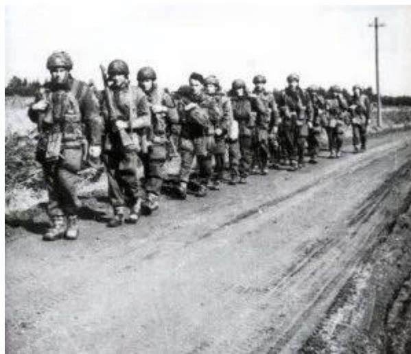
Polish soldiers liberating the Netherlands

"By acting in support of Poland's accession to the Union, and still supporting it now, I am paying off my moral debt. Because if it were not for Polish soldiers, I would not be born . My emaciated father would not survive without their care. He is currently suffering from Alzheimer's, losing his memory, but he still remembers his childhood and a Polish military tailor who made him a small Polish uniform."