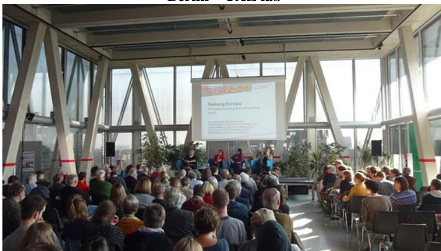
ESI at taz lab: Fortress Europe - The future of sea rescues (6 April)