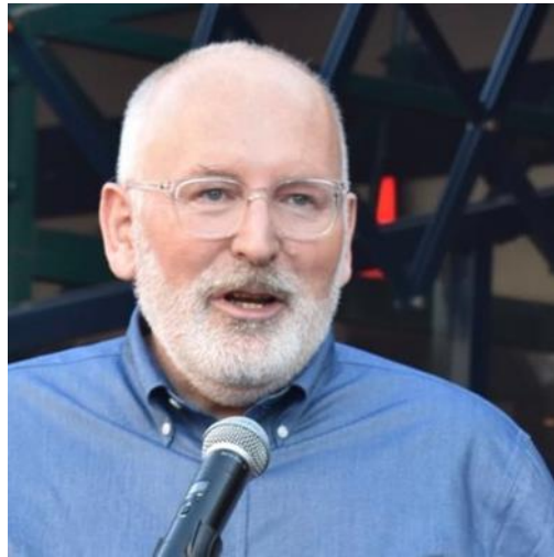
Guilty of defending the rule of law?

It is a response that reveals desperation. In fact, Frans Timmermans has a long history with Poland. He was decorated by two Polish presidents with the Order of Merit: President Bronisław Komorowski in 2014 and also, long before that, the late President Lech Kaczyński in 2006. As Timmermans told the daily Gazeta Wyborcza in November last year: