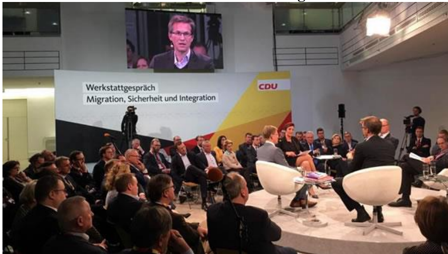
ESI at CDU "workshop debate" on migration policy (10 February)