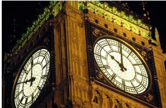
On causes and bells

"Rule of Law: European Commission launches infringement procedure to protect judges in Poland from political control"