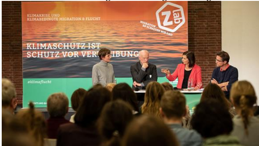
ESI at public debate on climate change, migration, and refugees (15 January)

Deutschlandfunk, Birgit Kolkmann, " Menschenrechte für Flüchtlinge sind nicht garantiert " - radio interview with Gerald Knaus - ("Human rights for refugees are not guaranteed") (13 April 2019)