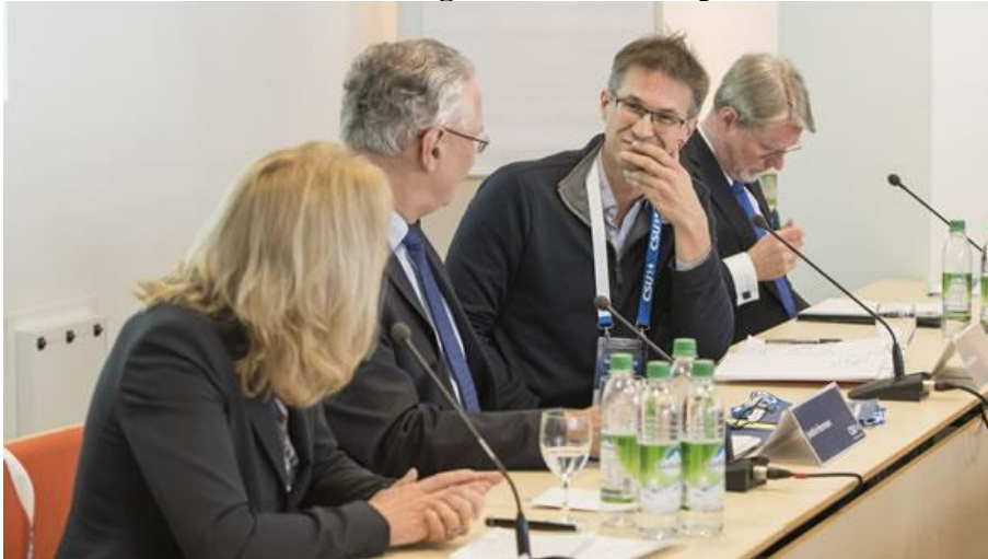
ESI at the CSU Europe party convention (30 March)