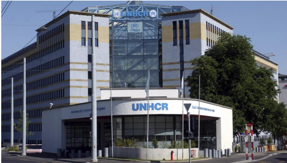
Geneva HQ of the UN High Commissioner for Refugees