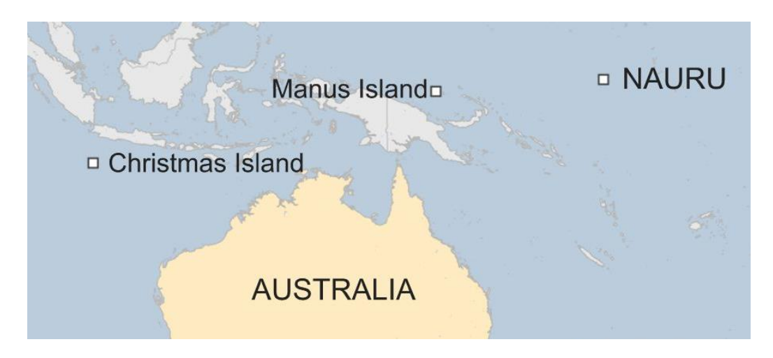
More: NEW The Damned of Papua New Guinea

Since mid-2013, Conservative and Labor governments have sent the same message to Hazara from Afghanistan fleeing the Taliban, to Christian converts from Iran fleeing the Islamic Republic and to refugees from Sudan fleeing indiscriminate violence in Darfur: if you try to come without a visa across the sea you will never get protection here. This policy remains in force today under the name "Operation Sovereign Borders." It means that the Australian navy will "turn around" any boat with asylum seekers it encounters and send it back to Indonesia or Sri Lanka. Alternatively, it might transfer asylum seekers to detention centres on the Pacific islands of Manus, in Papua New-Guinea, or the microstate Nauru, thousands of miles from Australia, for so-called "offshore" processing of any asylum claims.