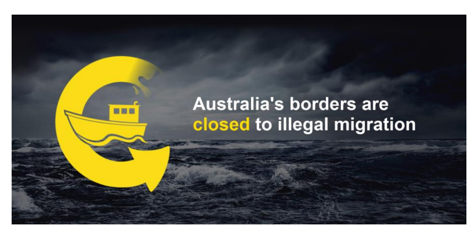
Australia's Operation Sovereign Borders website

"The message is simple: if you come to Australia illegally by boat, you will never have a way to become an Australian citizen. The rules apply to everyone: families, children – there are no exceptions."