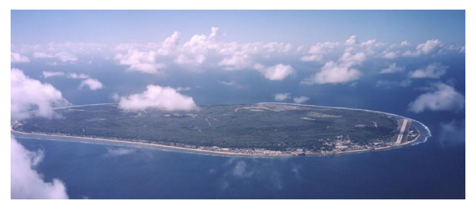
The popularity of pushbacks – lessons from Australia