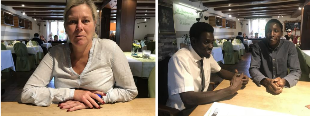
Success stories - two videos: Entrepreneur (in German) Gambian workers

to find a workable solution. There are already many local Gambian success stories of integration. There is a constituency for being reasonable.