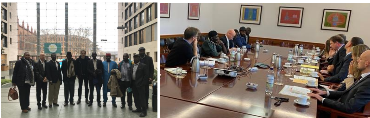
In the German Foreign Office