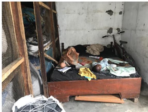
Poverty in The Gambia – not a democracy the EU should sanction

EU sanctions could take different forms. One would be to reduce economic assistance. Gambia is one of the poorest countries in Africa. Does it make any sense to single it out and punish it for resisting something other West African countries resist as well, only because it is smaller? Cui bono?