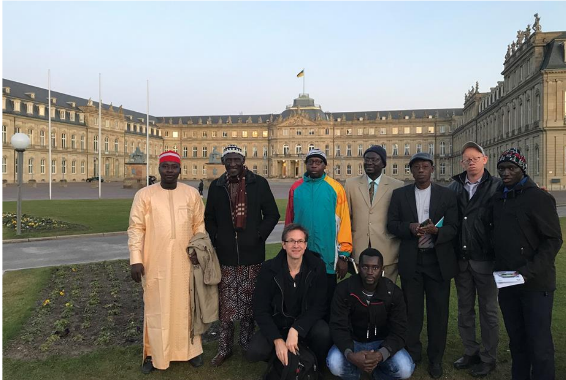
Searching for a breakthrough in Stuttgart (February 2020)