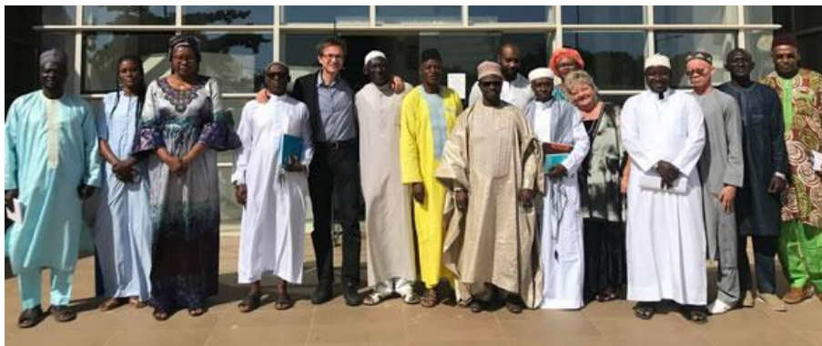
Outside the National Parliament in Banjul after ESI presentation

That same month ESI was invited to present the plan in the Gambian parliament, where it was praised. Cheikh Sidiya Jatta, the chair of the foreign affairs committee endorsed it publicly .