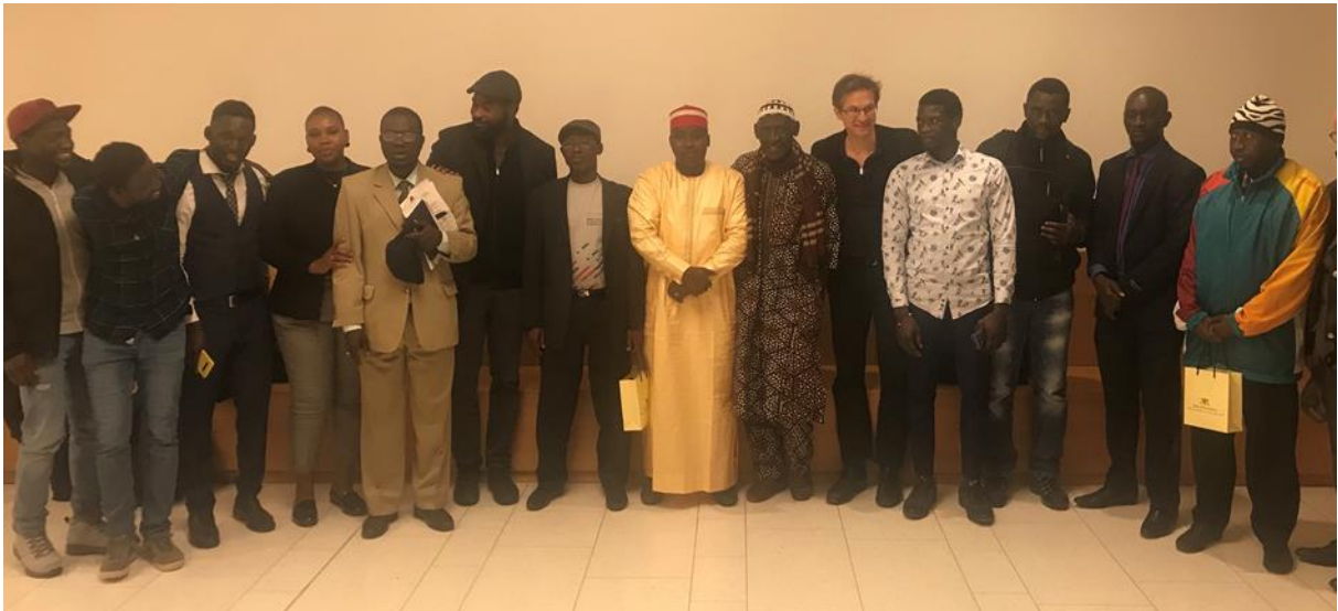
MPs meeting members of the diaspora and the Gambian Refugees Association in Germany