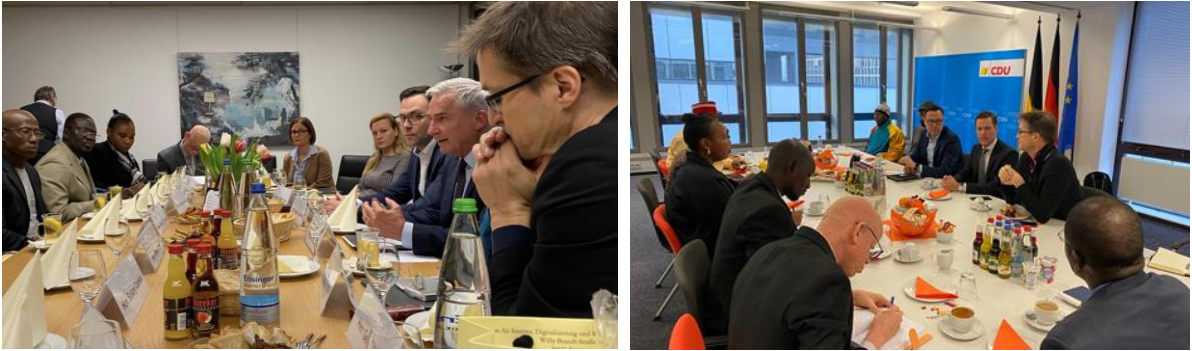
In Stuttgart with the minister of the interior – In Stuttgart with CDU members of state parliament