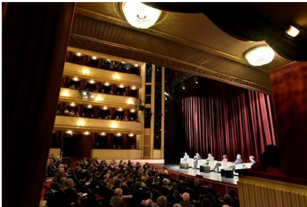
Debate on refugees in the Vienna Burgtheater