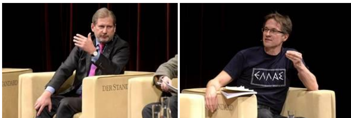
Vienna debate on refugees – Austria, Greece and Turkey