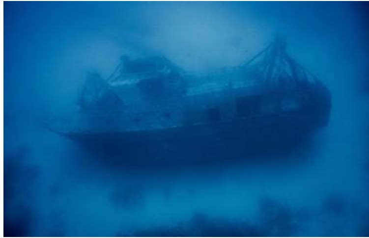
The deadly lack of a strategy: migrant boat on the bottom of the sea

Nobody in The Gambia wants a return to the tragedy of recent years, when tens of thousands were captured and mistreated in Libya and huge numbers died on the “backway” to Europe.