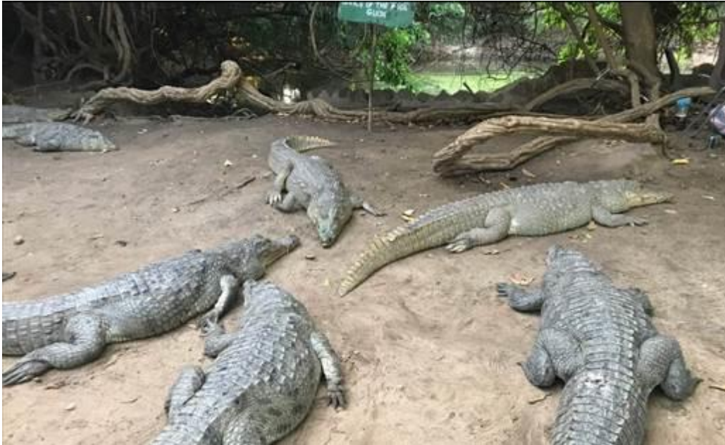
Creatures in a sacred pond near Banjul, waiting to be touched

For more on developments concerning rescues and The Gambia in the coming weeks please check my twitter account ( @rumeliobserver ) and go to www.rumeliobserver.eu .