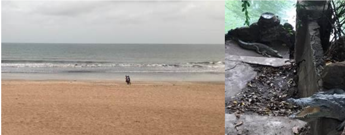
The Gambia in July 2019 – the point of the crocodiles here is ... (read to the end)