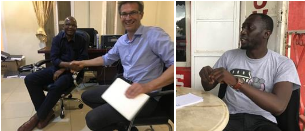
Policy needs support: the Gambian Minister of Youth – the leader of Gambia National Youth Council