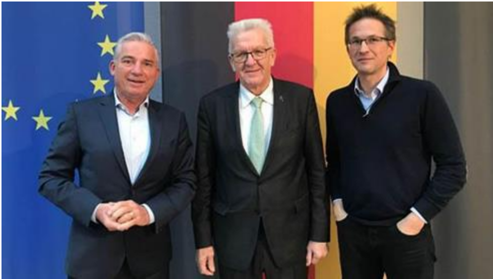
Discussing returns with the government of Baden-Württemberg (January 2019) Thomas Strobl, minister of the interior and Winfried Kretschmann, prime minister

Most Gambians in Germany today are resident in the state of Baden-Württemberg, which has 11 million inhabitants. Baden-Württemberg is one of the richest regions in the world. It has its own constitution, prime minister and parliament.