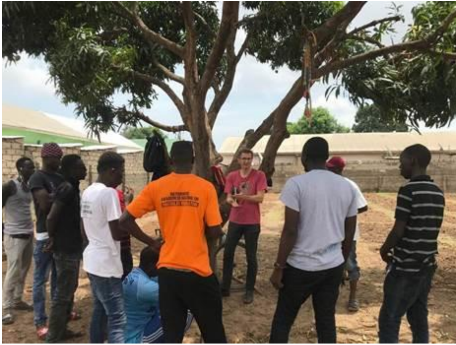
Debate with returnees from Libyan detention centres in The Gambia

Since mid-2017 IOM has helped more than 4,000 Gambians return home from Libya. The organisation YAIM ( Youth against irregular migration ), created by people formerly detained in Libya, is warning their compatriots against the dangers of irregular migration. Such returnees should receive support, and their fellow Gambians should be offered a clear signal that their country has a future and is not abandoned.