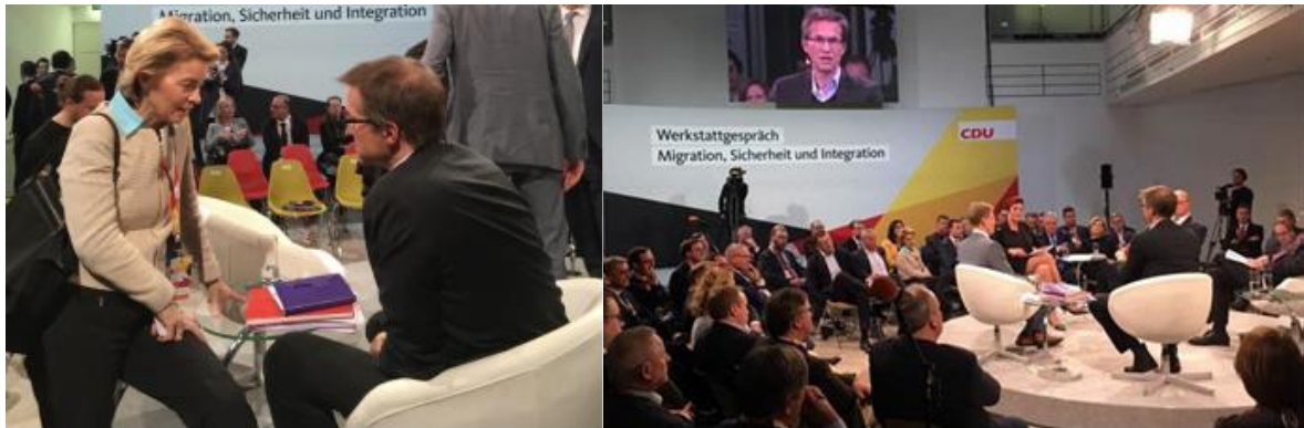
CDU Migration Workshop – Berlin January 2019

10,000 is the number of Gambians in the German state of Baden-Württemberg in 2019 likely to be liable to deportation. 144 is the total number of Gambians who were returned from Germany to The Gambia in 2018.