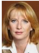
Doris Bures (SPO) Federal Minister for Transportation, Innovation and Technology