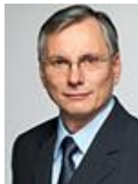
Alois Stöger (OVP) Federal Minister of Health