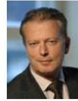
Reinhold Mitterlehner (OVP) Federal Minister for Economics and Labour