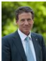
Karlheinz Töchterle (OVP) Federal Minister of Science and Research