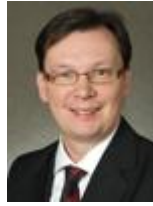
Norbert Darabos (SPO) Federal Minister of Defence