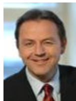
Nikolaus Berlakovich (OVP) Federal Minister for Agriculture and Environment