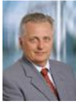
Rudolf Hundstorfer (SPO) Federal Minister for Employment, Social Issues and Consumer Protection