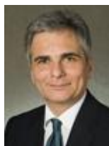
Werner Faymann (SPO) Federal Chancellor