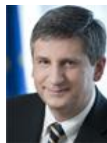
Michael Spindelegger (OVP) Vice Chancellor and Federal Minister for European and International Affairs