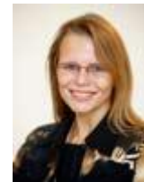
Beatrix Karl (OVP) Federal Minister of Justice