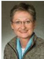
Claudia Schmied (SPO) Federal Minister for Education, Arts and Culture