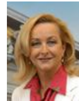
Maria Fekter (OVP) Federal Minister for Finance