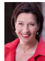
Gabriele Heinisch-Hosek (SPO) Federal Minister for Women, Media and Civil Service