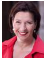
Johanna Mikl-Leitner (OVP) Federal Minister of Interior