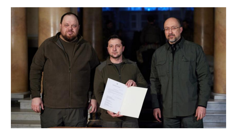
For a Europe whole and free