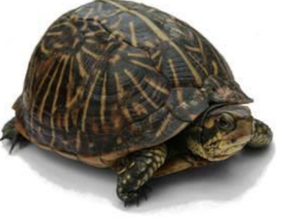
Accession as a turtle race