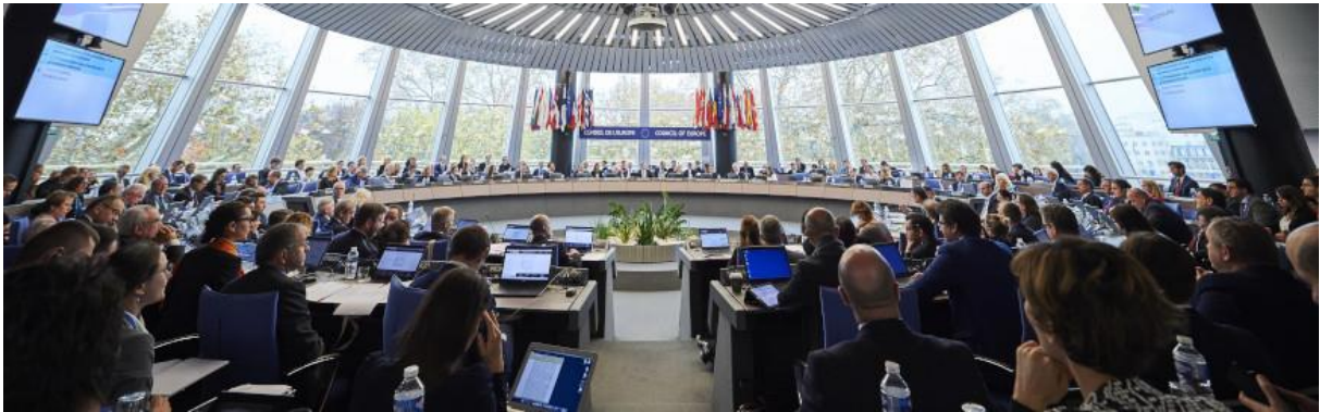
Ambassadors in the Committee of Ministers in Strasbourg

On 24 January this year, the Parliamentary Assembly of the Council of Europe (PACE) voted overwhelmingly to suspend the Azerbaijani delegation from the Assembly. So far, the Committee of Ministers of the Council of Europe has not responded either to PACE's decision, or to the dramatic deterioration of human rights that prompted it.