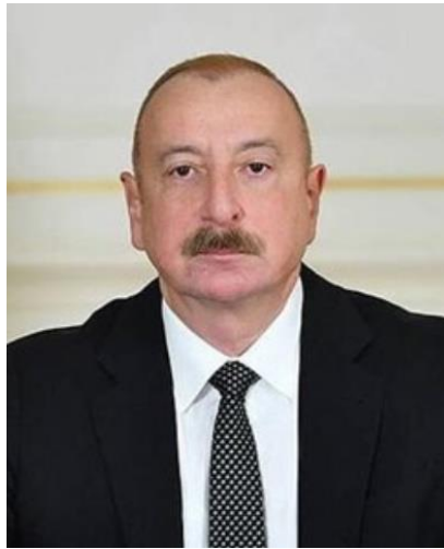
Ilham Aliyev President since 2003