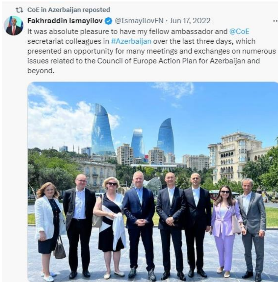
The Azerbaijani Ambassador to the Council of Europe welcomes fellow Ambassadors from the Committee of Ministers in Baku in June 2022.