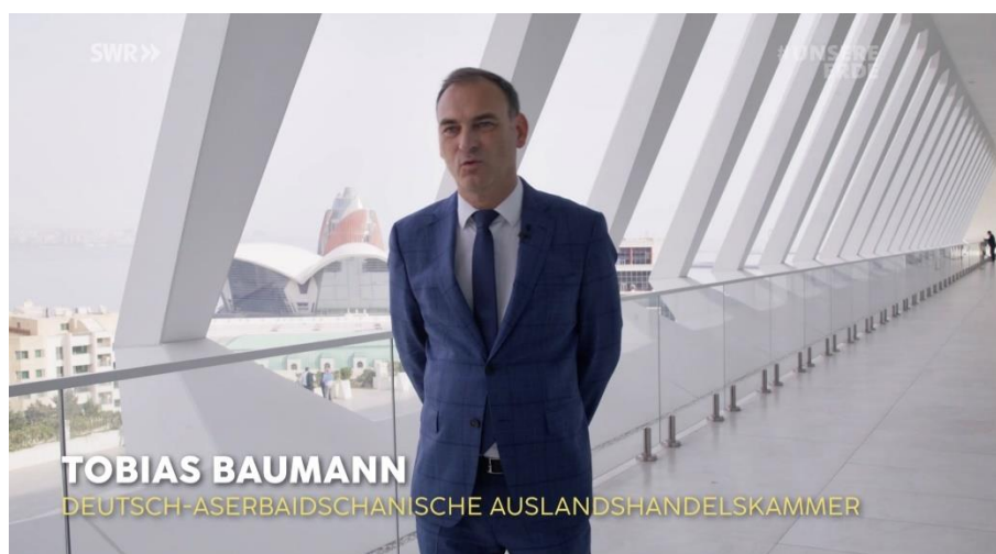
Documentary “Am Abgrund” (On the edge) on German businesses in Baku