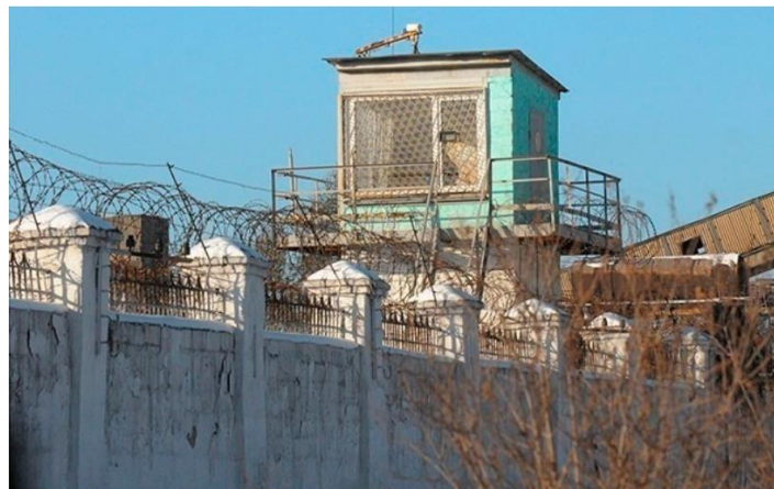
Kurdakhani Detention Centre, scene of abuse and torture