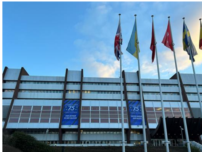
How to celebrate the first 75 years? (1949-2024)