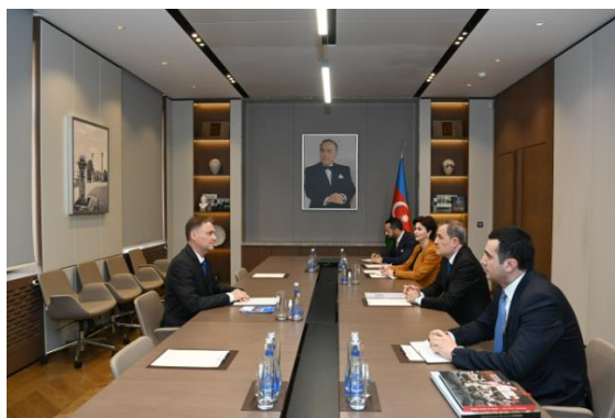
Petr with Foreign Minister in Baku

position under PACE presidents Mevlüt Çavuşoğlu 41 and Jean Claude Mignon. 42 In 2013, he is appointed to head the Council of Europe Office in Russia. 43